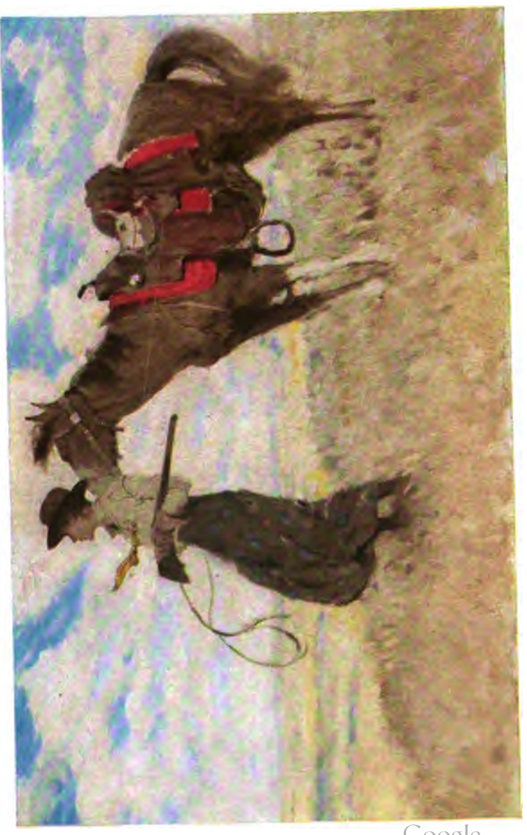
Digitized by Google